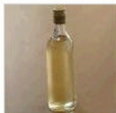
Pure Sesame Oil