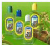
Essences Of Pine Oils Coala