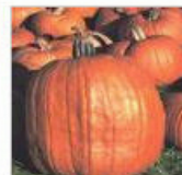
Pumpkin Seeds Oil